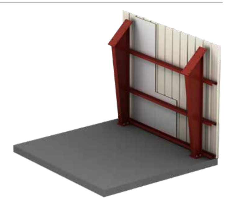
Illustration 2 Engineered Metal Building Wall