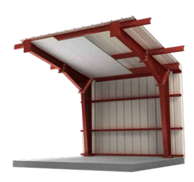
Illustration 1 Engineered Metal Building Ceiling

EnergyShield Pro is recommended for use in both commercial and residential construction (Type I through Type V) where a Class A flame spread is needed. This guidance document addresses the installation of Product in interior exposed applications with white facer facing outward (to the interior) for interior walls only or interior ceilings only.